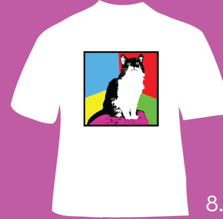
8. Pop Art Boo