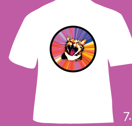
7. Pop Art Billie